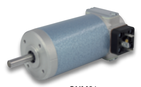
GNM31.. with connector

Customized modifications are also among our core strengths in this series!