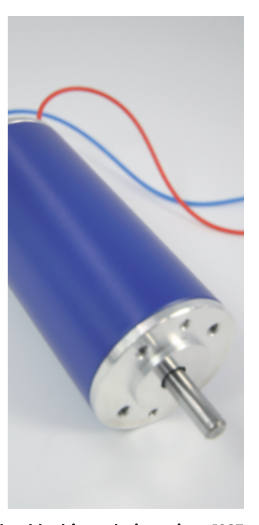
Your trusted partner for durable drive solutions since 1923