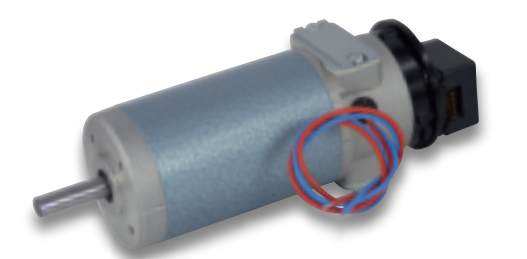
GNM31.. with incremental encoder