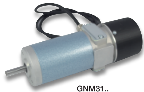
with holding brake